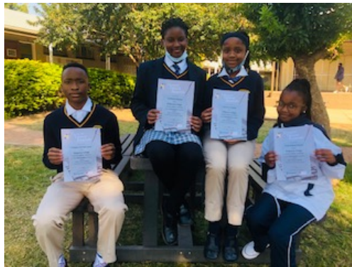
SILVER CERTIFICATE WINNERS